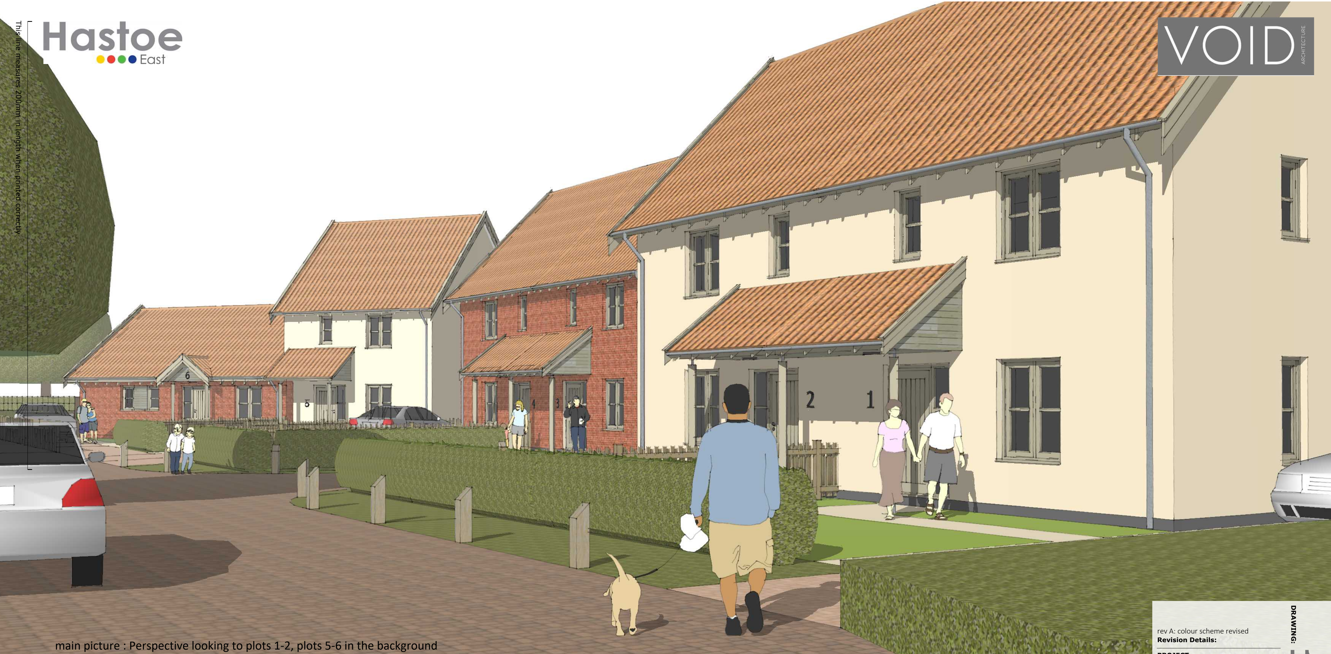
main picture : Perspective looking to plots 1-2, plots 5-6 in the background below: proposed development viewed from across fields to the south