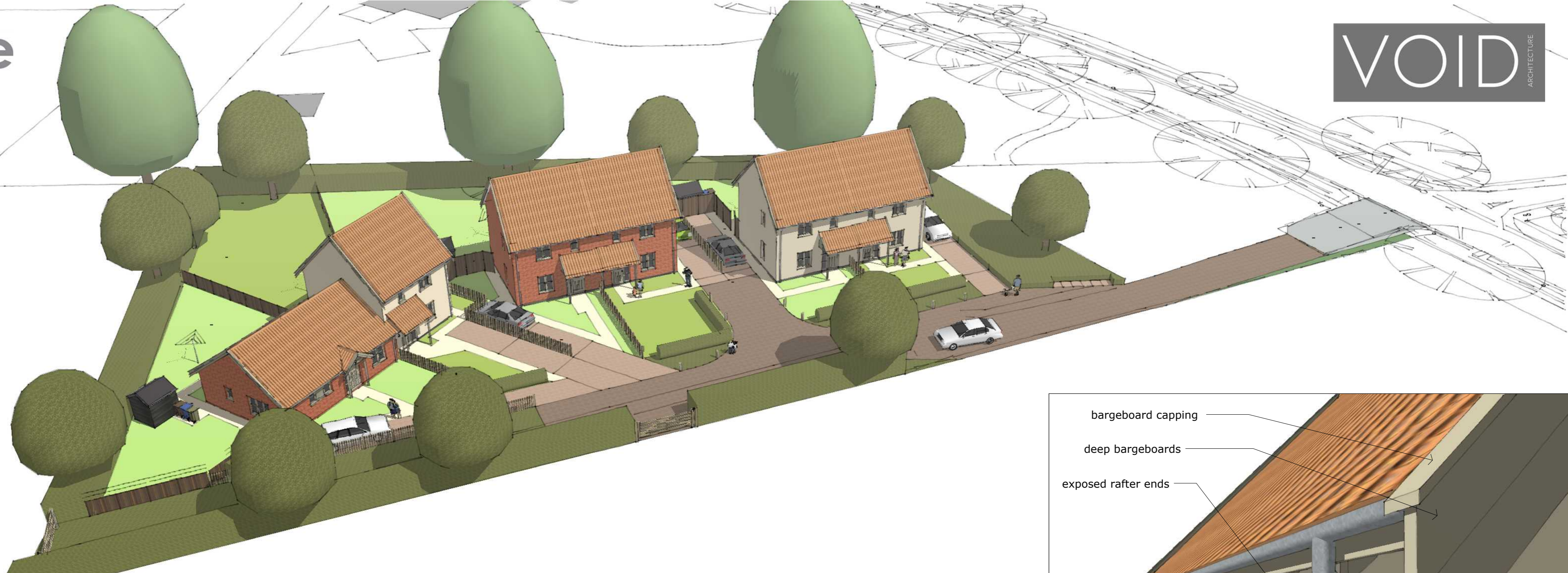
above: Aerial perspective looking to the north below: Perspective view of plots 4-6, plots 1-2 in the distance

This line measures 200mm in length when printed correctly